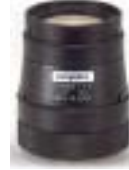
5 - 50mm Auto Iris Varifocal lens