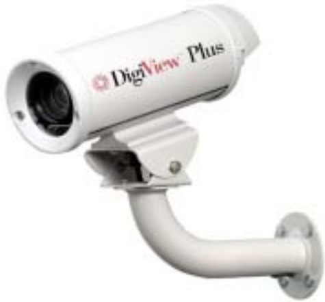
Standard "L" bracket with outdoor enclosure