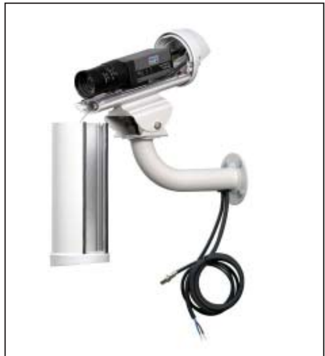
Slide-off design for full accessibility