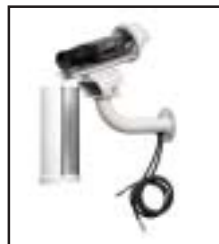
Slide-off design for full accessibility