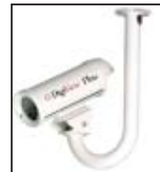
with optional ceiling 'J' bracket