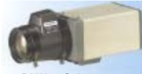
B&W or Color cameras